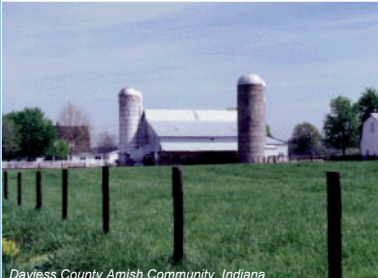
Davless County Amish Community, Indiana