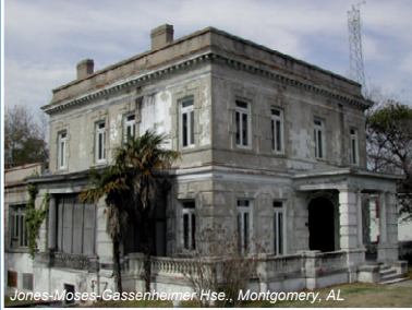
Jones-Moses-Gessenheimer Hse., Montgomery, AL