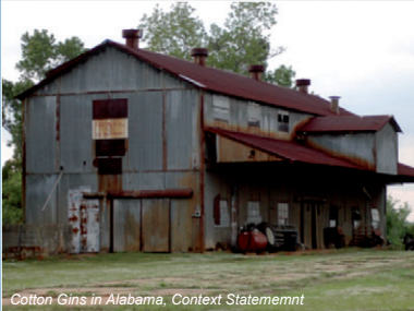
Cotton Gins in Alabama, Context Statement