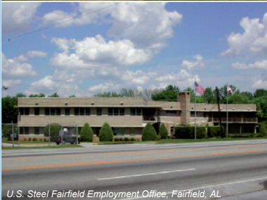
U.S. Steel Fairfield Employment Office, Fairfield, AL