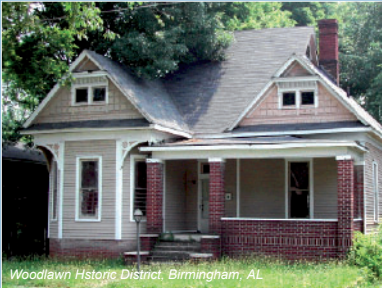
Woodlawn Historic District, Birmingham, AL