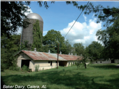
Baker Dairy, Calera, AL