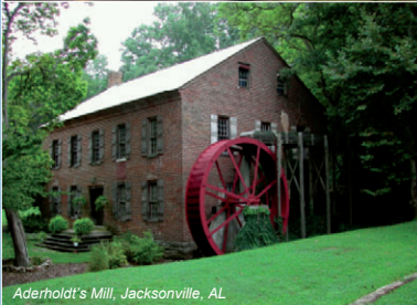
Aderholdt's Mill, Jacksonville, AL