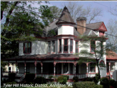
Tyler Hill Historic District, Anniston, AL

The City of Huntsville's historic districts are exceptional examples of how local historic designation and design review can not only maintain the character of historic neighborhoods but substantially improve property values as well. SHP prepared a set of design guidelines to help the city's historic preservation commission make more consistent decisions and to help promote a broader community understanding about the design review process.