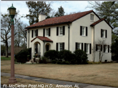
Ft. McClellan Post HQ H.D., Anniston, AL