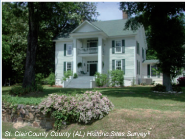
St. Clair County (AL) Historic Sites Survey