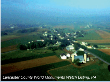
Lancaster County World Monuments Watch Listing, PA