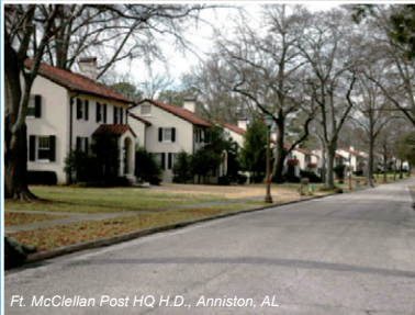
Ft. McClellan Post HQ H.D., Anniston, AL