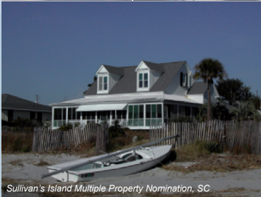
Sullivan's Island Multiple Property Nomination, SC

Traditionally the resort island for the residents of Charleston, rising property values have resulted in the demolition of many of the islands historic resources. SHP has completed historic preservation component of a major revision to the town's planning and zoning ordinances (2003), a National Register Multiple Property Documentation Form and four historic district nominations (2006), and a selected survey of buildings over sixty years old for possible local designation (2007).