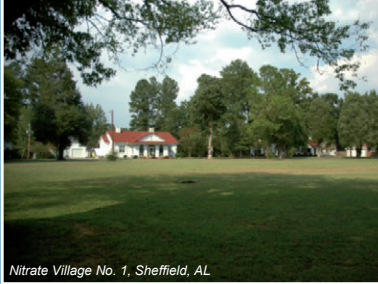
Nitrate Village No. 1, Sheffield, AL