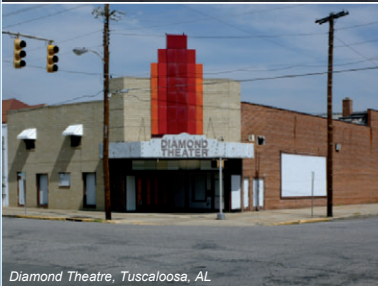
Diamond Theatre, Tuscaloosa, AL