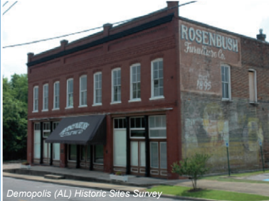
Demopolis (AL) Historic Sites Survey