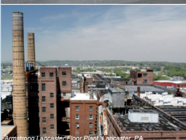
Armstrong Lancaster Floor Plant, Lancaster, PA

SHP coordinated the local, state and federal historic preservation reviews for the demolition of a substantial portion of the 2.6 million square foot Lancaster Floor Plant of Armstrong Cork Company (now AWI). Once the largest factory in the world producing linoleum, the plant was the dominant leader among Lancaster County's expansive and diverse industrial sector for almost a century. Both Franklin and Marshall College and the Lancaster General Hospital will expand onto the site.