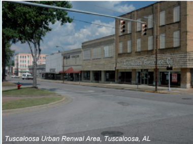
Tuscaloosa Urban Renewal Area, Tuscaloosa, AL