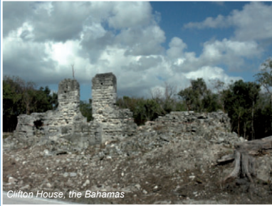
Clifton House, the Bahamas

SHP has consulted on more than 200 projects involving federal tax incentives for historic preservation including the use of rehabilitation tax credits and the donation of conservation easements. His services include design consultation, negotiations with state and federal review agencies and easement holding organizations, preparation of Historic Preservation Certification Applications and project appeals.