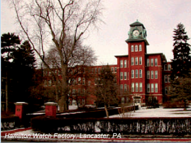
Hamilton Watch Factory, Lancaster, PA