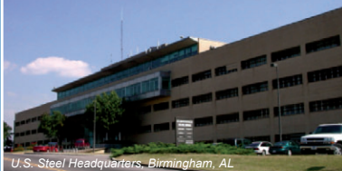
U.S. Steel Headquarters, Birmingham, AL