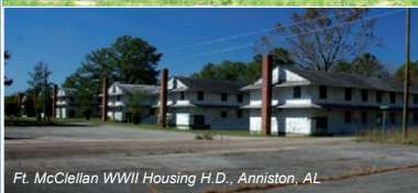
Ft. McClellan WWII Housing H.D., Anniston, AL