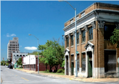
Downtown Ensley, Alabama