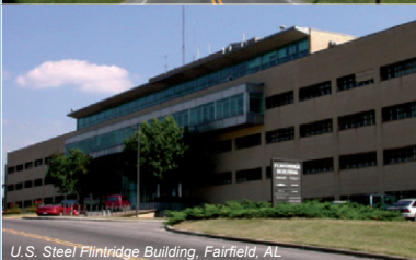
U.S. Steel Pintridge Building, Fairfield, AL