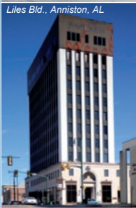
Liles Bld., Anniston, AL