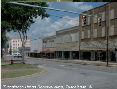
Tuscaloosa Urban Renewal Area, Tuscaloosa, AL

SHP completed Historical American Buildings Survey Documentation for three city blocks in downtown Tuscaloosa that will be demolished to make way for a new federal courthouse project. The project involved preparation of a narrative history and architectural description of the blocks and their individual buildings, large format and digital photography, and measured streetscape drawings.