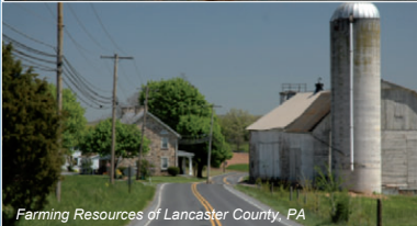
Farming Resources of Lancaster County, PA