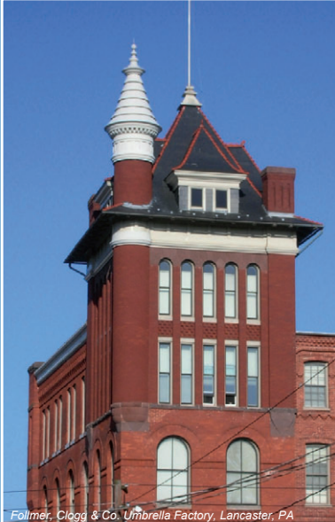
Folmer, Clogg & Co. Umbrella Factory, Lancaster, PA