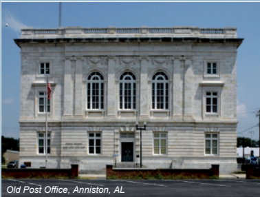
Old Post Office, Anniston, AL