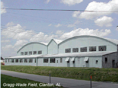
Gragg-Wade Field, Clanton, AL