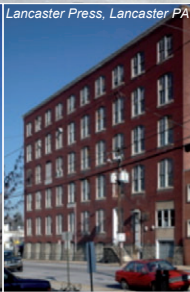
Lancaster Press, Lancaster PA