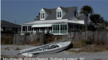
Moultrieville Historic District, Sullivan's Island, SC