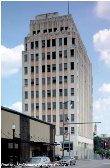
Ramsay-McCormack Building, Ensley, AL

*while with Preservation Consultants, Inc.