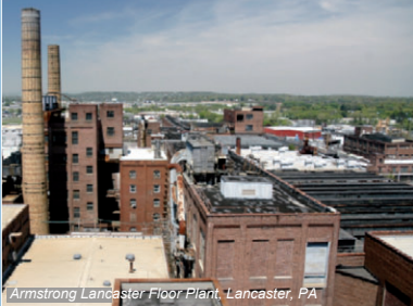
Armstrong Lancaster Floor Plant, Lancaster, PA