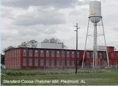
Standard-Coosa-Thatcher Mill, Piedmont, AL