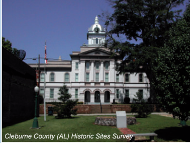
Clebune County (AL) Historic Sites Survey