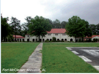
Fort McClellan, Anniston, AL

SHP completed a variety of environmental review projects involving Section 106 and other local, state, and federal regulations. In addition to negotiating with review agencies, he has completed Historic American Buildings Survey level documentation for projects involving a diverse range of sizes and complexity. In addition, SHP has completed numerous urban and rural historic resource surveys, historic structures reports, and published histories.