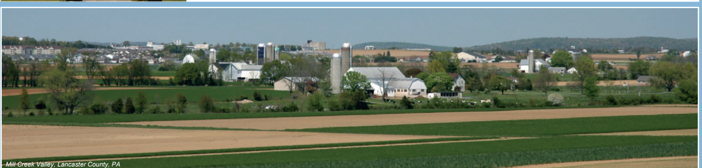
Mill Creek Valley, Lancaster County, PA