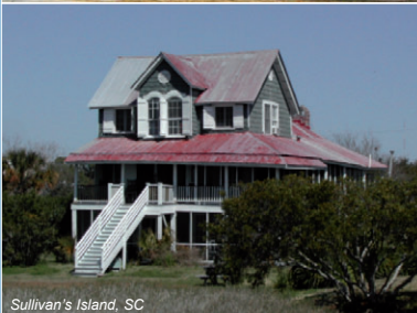
Sullivan's Island, SC