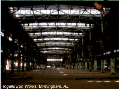
Ingalls Iron Works, Birmingham, AL