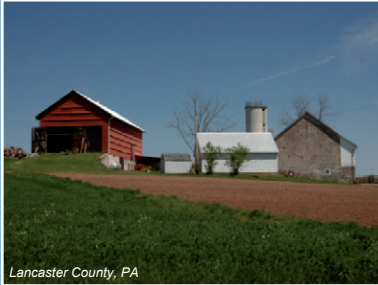
Lancaster County, PA