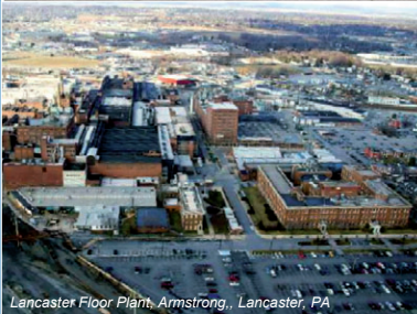
Lancaster Floor Plant, Armstrong, Lancaster, PA