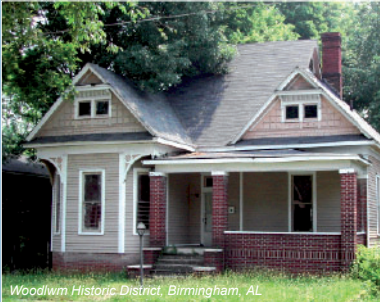
Woodlawn Historic District, Birmingham, AL