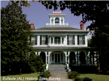
Eufaula (AL) Historic Sites Survey