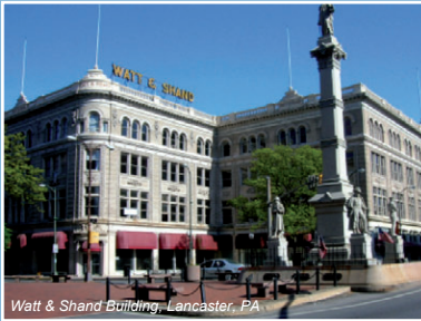
Watt & Shand Building, Lancaster, PA

*while with Preservation Consultants, Inc.