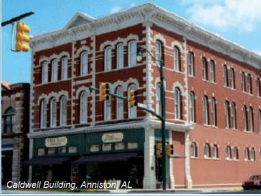
Caldwell Building, Anniston, AL

SHP has completed individual, district and multiple property nominations to the National Register of Historic Places. Mr. Schneider extensive experience with rural historic landscape designation including completion of a multiple property documentation project for the Historic Farming Resources of Lancaster County, Pennsylvania. He has also completed nominations on such diverse resources as a chocolate factory and aircraft hangars.