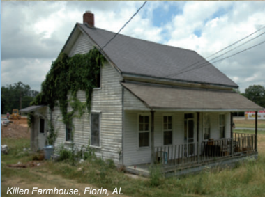
Killen Farmhouse, Florin, AL