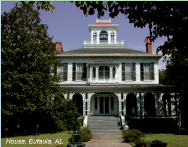
House, Eufaula, AL