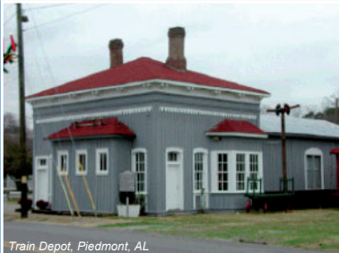
Train Depot, Piedmont, AL