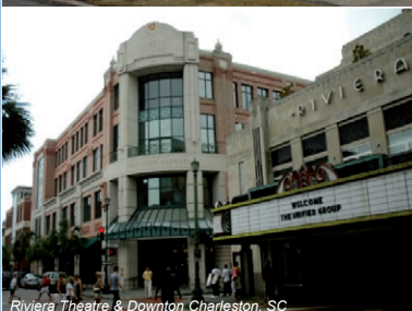
Riviera Theatre & Downtown Charleston, SC