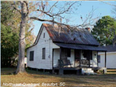
Northwest Quadrant, Beaufort, SC